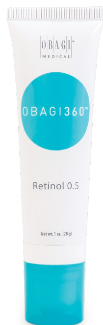
Obagi Retinol 0.5 ‡