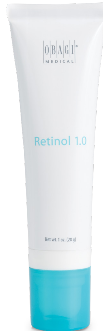
Obagi Retinol 1.0